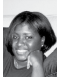
Jewel Crawford Ministry of Education and Youth, Belize