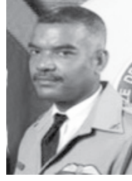
Lt. Col. Ganney Dortch Belize Defense Force, Belize