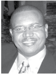
Gordon Burton Caribbean Management Services Limited, Turks & Caicos