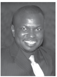
Drexwell Seymour Cable & Wireless Limited, Turks & Caicos