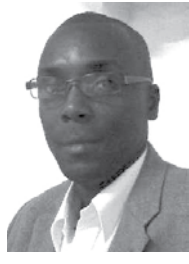
Hubert Burchell Urlin Mayor and City Council Georgetown, Guyana